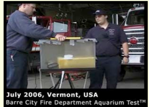
July 2006, Vermont, USA Barre City Fire Department Aquarium Test™

By 1980 Fire Chiefs had been promoting ionization detectors for almost a decade. To find out what happened since 1980 which will help you understand why the truth has been buried, check out smoke detector history .