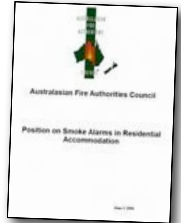
AFAC's Official Position on Smoke Alarms 01 June, 2006

The truth about ionization smoke alarms is NOT getting to most firefighters - yet alone the public. The Foundation believes ionization smoke alarms are NOT safe and firefighters and the public's lives are at needless risk because they have not been made fully aware of the facts. Please fill in the 'Disclosure Letters' and discover the truth for yourself.