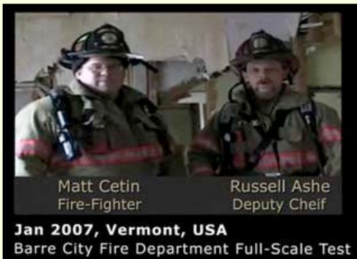
Jan 2007, Vermont, USA Barre City Fire Department Full-Scale Test